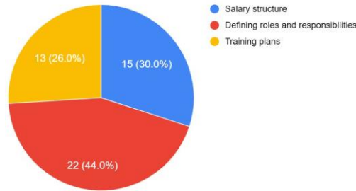
Count of Job analysis helps in?